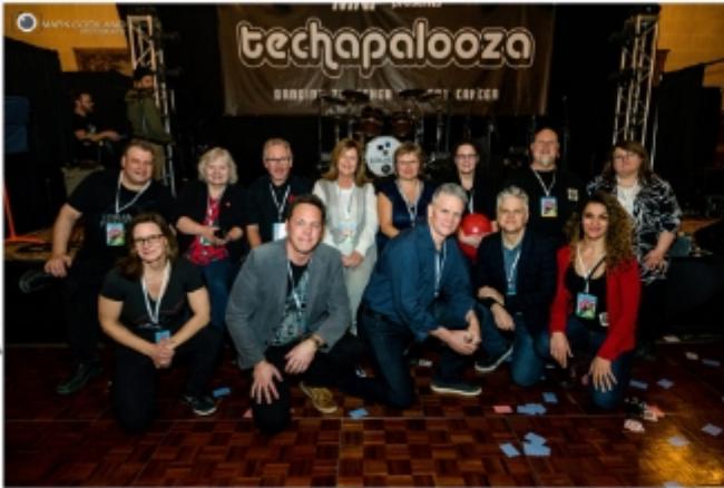
Techapalooza Committee - 2019